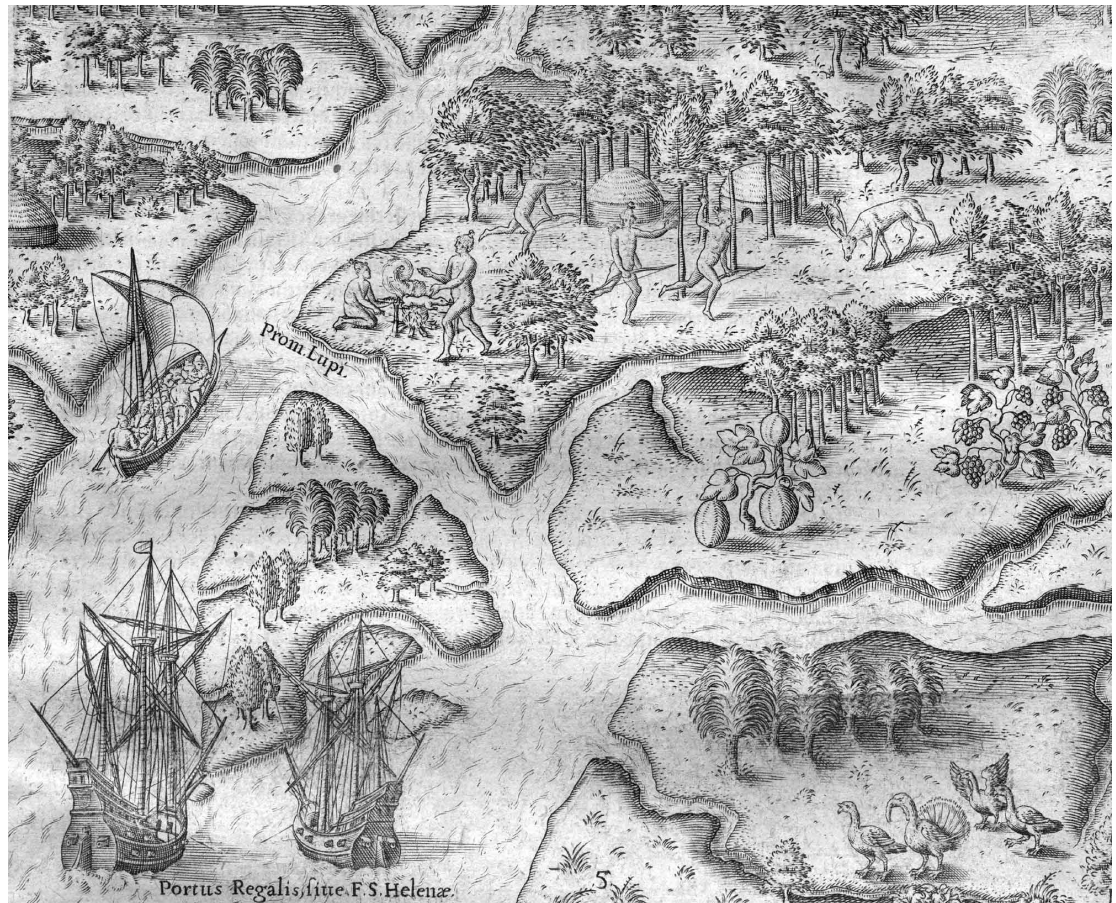
French Arrive at Port Royal. Engraving from Johann Ludwig Gottfried, Neue Welt vnd Americanische Historien , p. 325. Frankfurt, 1655. (A)-119)