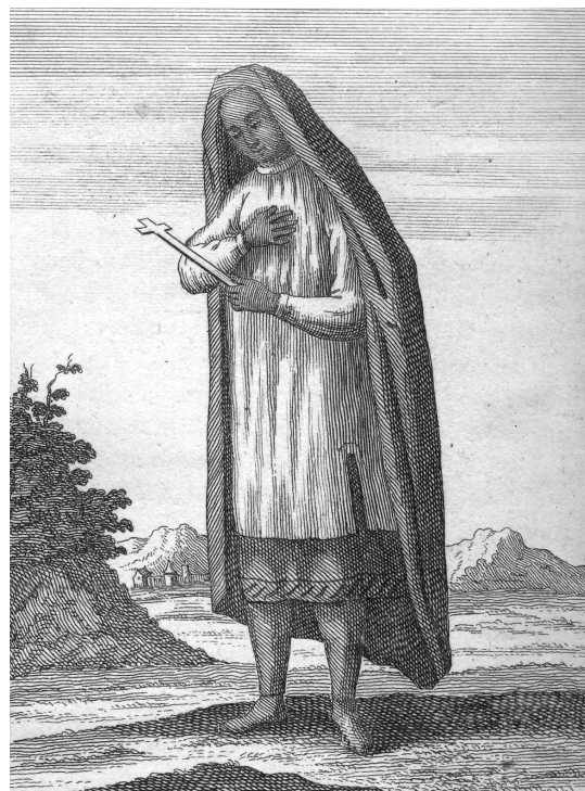
Catherine Tekakwitha, an Iroquois convert to Catholicism. From M. de Bacqueville de La Potherie, Histoire de l’Amerique Septentrionale... Volume 2, p. 350a. Paris, 1753. (AJ-145)

described the religious persecution that drove him and his followers out of England. The first chapter of his history ends with their decision to go to Holland, where they understood they would have religious freedom. (The Mayflower sailed in 1620 from Holland to the New World, rather than directly from England.) The American Journeys web site contains the whole of Bradford’s original text (nearly 500 pages).