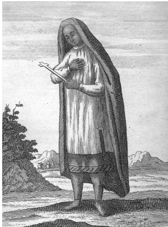
Catherine Tekakwitha, an Iroquois convert to Catholicism. From M. de Bacqueville de La Potherie, Histoire de l’Amerique Septentrionale... Volume 2, p. 350a. Paris, 1753. (AJ-145)

described the religious persecution that drove him and his followers out of England. The first chapter of his history ends with their decision to go to Holland, where they understood they would have religious freedom. (The Mayflower sailed in 1620 from Holland to the New World, rather than directly from England.) The American Journeys web site contains the whole of Bradford’s original text (nearly 500 pages).